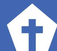
Bishops Training Institute