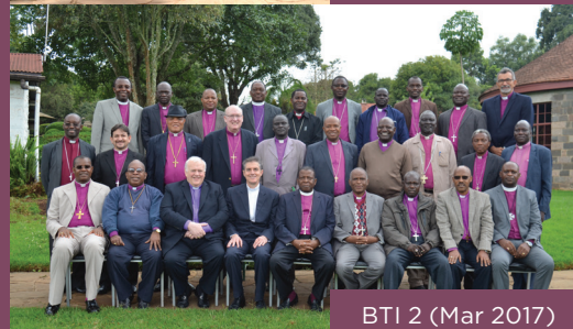
BTI 2 (Mar 2017)