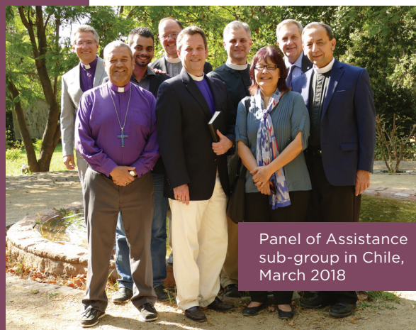
Panel of Assistance sub-group in Chile, March 2018

Gafcon gathers faithful Anglicans both physically, through conferences and networks, but also electronically through e-communications and social media.