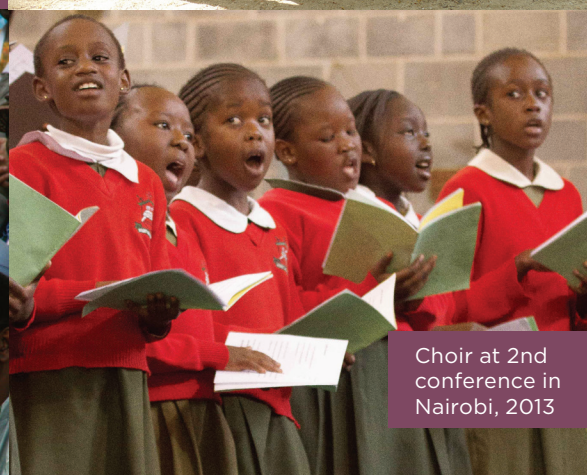
Choir at 2nd conference in Nairobi, 2013