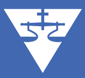
Lawyers Task Force