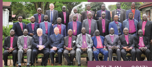
BTI 3 (Nov 2017)