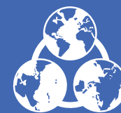
Global Mission Partnership