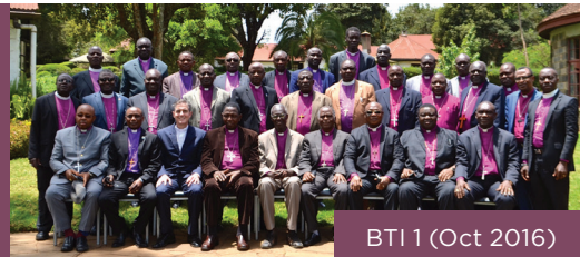
BTI 1 (Oct 2016)